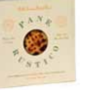
PANE RUSTICO OLIO E SALE 627 / 250 gm.