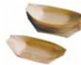
ANTIPASTI CEDAR SERVING BOATS 2011