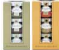
PESTO COLLECTIONS CLASSIC: 100 / 3-6 oz. CHEFS: 101 / 3-6 oz.