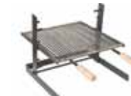
TUSCAN ITALIAN GRILL 9001 / original