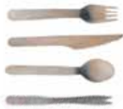
ALFRESCO FORKS, SPOONS, KNIVES & SERVING FORK 2005-2007, 2010