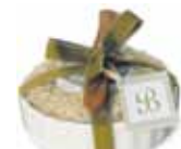
ARTICHOKE BAKING DISH 1015