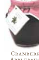
CRANBERRY APPLESAUCE 707 / 23 oz.