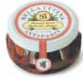
ROASTED SWEET BALSAMIC PEPPERS 403 / 6 oz.