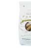
PENNONI REGATE PASTA 3002 / 1.1 lb.