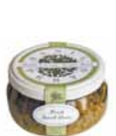
FRESH BASIL PESTO 111 / 6 oz.