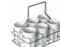
TAZZA CARRIER WITH TAZZA ESPRESSO CUPS 2044