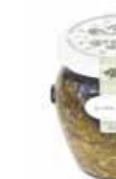
GARDEN HERB PANINI SPREAD 603 / 6 oz.