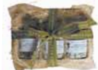
SAVORY SALT TRIO BALSAWOOD GIFT Oregano, Citrus & Porcini / 1900 Lavender, Rose & Calendula / 1901