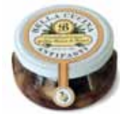
CARAMELIZED ONION & GOLDEN RAISIN 401 / 6 oz.