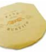
PANE RUSTICO ITALIAN FLATBREAD 625 / 2.2 lb.