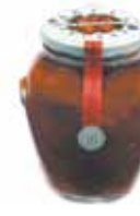
SUGO ALL'ARRABIATA 3006 / 23 oz.