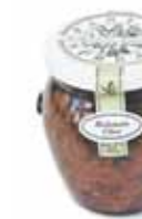
KALAMATA OLIVE PANINI SPREAD 601 / 6 oz.