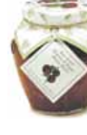
SUN-DRIED TOMATO AND CAPER FARMHOUSE SUGO 3001 / 23 oz.