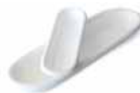
ANTIPASTI SERVING TRAYS 2064 / piccolo, 12.5" 2063 / grande, 18"