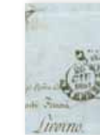
POSTE-ITALIANE LIVORNO 7006 / piccolo 7007 / grande