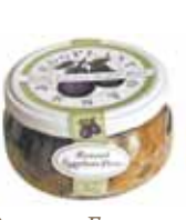
ROASTED EGGPLANT PESTO 142 / 6 oz.