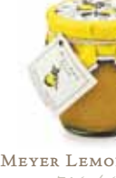
MEYER LEMON SPREAD 746 / 6 oz.