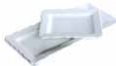
RECTANGULAR PLATTER 2051 / piccolo 12" 2045 / grande 18"