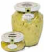
ARTICHOKE LEMON PESTO 132 / 6 oz., 131 / 23 oz.