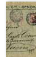
POSTE-ITALIANE VERONA 7002 / piccolo 7003 / grande