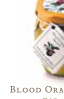
BLOOD ORANGE SPREAD 748 / 6 oz.