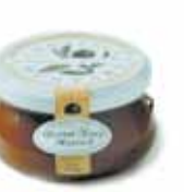
CHESTNUT HONEY MUSTARD 346 / 6oz.