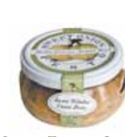
SWEET VIDALIA ONION PESTO 143 / 6 oz.