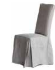
DINING CHAIR 4060, without slipcover 4006N, Slipcover/Natural 40" x 39" x 18" *C.O.M. by request