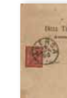
POSTE-ITALIANE AVERSA 7014 / piccolo 7015 / grande