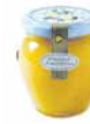
PRESERVED LEMON CREAM 745 / 6 oz.