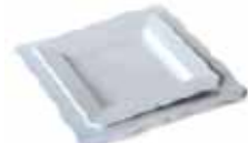
SALAD PLATE 2031 / 8" DINNER PLATE 2030 / 10"