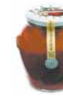
SUGO ALL'PEPERONATA 3007 / 23 oz.