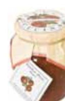
POMODORO PIZZA SAUCE 501 / 23 oz.