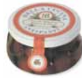
PICCOLO POMODORO TOMATO & BASIL 404 / 6 oz.