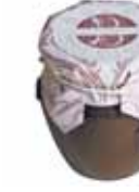
DOLCI NOCCIOLA 791 / 6 oz.