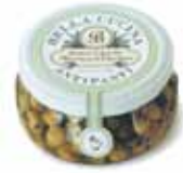
LEMON & MINT MARINATED CHICKPEAS 402 / 6 oz.