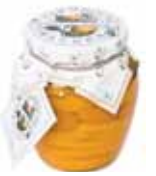
PRESERVED ORANGES PICCOLO 495 / 10 oz.