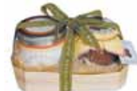
PIZZA GIFT 1710