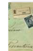
POSTE-ITALIANE PESCANTINA 7012 / piccolo 7013 / grande