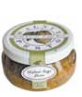
WALNUT SAGE PESTO 141 / 6 oz.