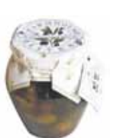
ANTIPASTI OLIVES PICCOLO 496 / 10 oz.