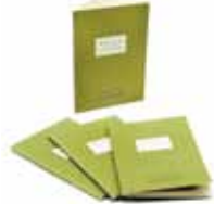
IL PICCOLO LIBRO, 25 SIMPLE RECIPES 41