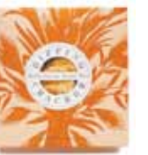
BELLA'S DIPPING CRACKER BOX 622 / 5.5 oz.