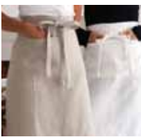
CHEF'S APRON 4000N, natural / 35" x 37" 4000W, white / 35" x 37"