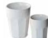
TAZZA ESPRESSO CUPS 2042 / 3" tall 2043 / 4" tall