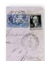
POSTE-ITALIANE ROMA 7018 / piccolo 7019 / grande