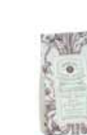
CIOCCOLATI DOLCI BAG 720 / 6 oz.