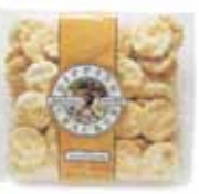
BELLA'S DIPPING CRACKER BOX 623 / 5.5 oz.