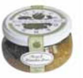
MINT & PISTACHIO PESTO 147 / 6 oz.