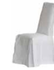
DINING CHAIR 4060, without slipcover 4006W, Slipcover/White 40" x 39" x 18" *C.O.M. by request