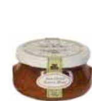
SUN-DRIED TOMATO PESTO 113 / 6 oz.