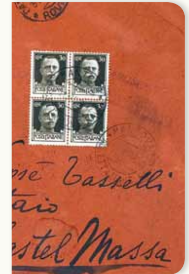
CASTEL MASSA GIORNALE