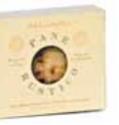
PANE RUSTICO OLIO E SALE 626 / 100 gm.