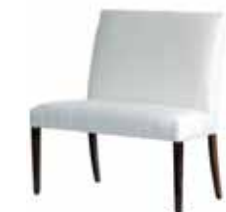
DINING BENCH 4061, without slipcover 4007N, Slipcover/Natural 4007W, Slipcover/White 40" x 39" x 18" *C.O.M. by request