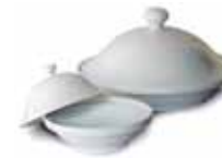
TAGINE COOKERS 2078 / mezzo, 8" 2079 / grande, 14.5"