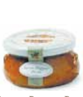
SWEET PEPPER PESTO 133 / 6 oz.