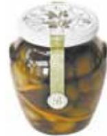
CITRUS FENNEL OLIVES GRANDE 498 / 23oz.