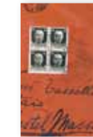
POSTE-ITALIANE CASTEL MASSA 7004 / piccolo 7005 / grande