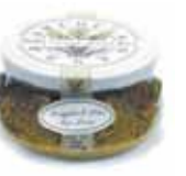
ARUGULA & PINE PESTO 145 / 6 oz.