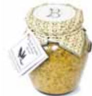
ARTICHOKE SPINACH BRUSCHETTA SPREAD 650 / 10 oz.