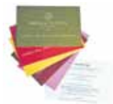
RECIPE CARDS 44