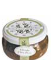
OLIVADA OLIVE PESTO 112 / 6 oz.