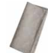
EUROPEAN NAPKIN 4004N, natural / 22" x 22" 4004W, white / 22" x 22"