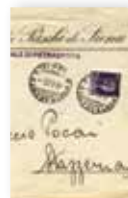
POSTE-ITALIANE PIETRA SANTA 7000 / piccolo 7001 / grande