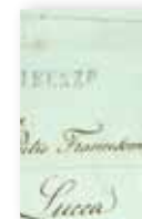
POSTE-ITALIANE LUCCA 7010 / piccolo 7011 / grande