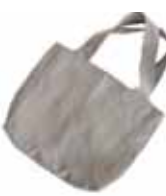
MARKET TOTE 4008N, natural / 16" x 15" x 4" 4008W, white / 16" x 15" x 4"