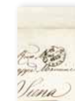
POSTE-ITALIANE SIENA 7016 / piccolo 7017 / grande