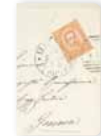
POSTE-ITALIANE GENOVA 7008 / piccolo 7009 / grande