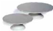
CAKE STAND 2048 / piccolo 10" 2049 / grande 14"