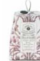
CIOCCOLATI DOLCI BOX 717 / 3/4 lb.