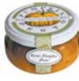
SWEET PUMPKIN PESTO 144 / 6 oz.