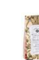
BISCOTTI DOLCI BAG 719 / 6 oz.