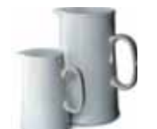
SERVING PITCHER 2062 / piccolo, 7" 2033 / grande, 10"