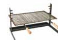
TUSCAN ITALIAN GRILL 9002 / grande