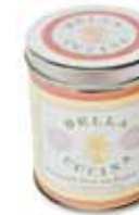
TRADIZIONALE PIZZA AND FOCACCIA DOUGH 502 / 15 oz.