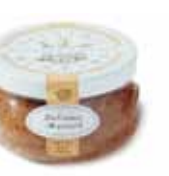
BALSAMIC MUSTARD 305 / 6oz.