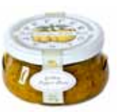
GOLDEN PEPPER PESTO 148 / 6 oz.