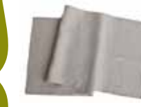
TABLE RUNNER 4005N, natural / 18" x 22" 4005W, white / 18" x 22"