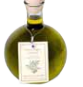
A TASTE OF TUSCANY EXTRA VIRGIN OLIVE OIL 227 / 16 oz.