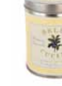
BLUEBERRY BUTTERMILK PANCAKE MIX 631 / 16 oz.