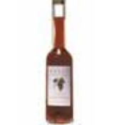
CABERNET VINEGAR 300 / 6.7 oz.