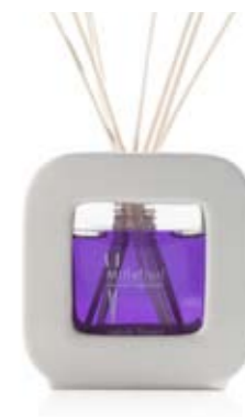
7FR - 250 ml FRAME DIFFUSER NATURAL

PACK 3 NET PRICE $ 10.00 PRICE FOR PACK $ 30.00