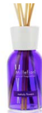
7DD - 250 ml FRAGRANCE DIFFUSER

PACK 3 NET PRICE $ 17.50 PRICE FOR PACK $ 52.50