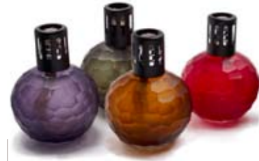
2LCA CARVED CATALYTIC DIFFUSER

PACK 3 NET PRICE $ 20.00 PRICE FOR PACK $ 60.00