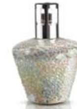
1LMOCKWH cracklé white