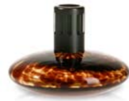
2LALBW - «turquoise shell» CATALYTIC DIFFUSER ALADIN

PACK 3 NET PRICE $ 20.00 PRICE FOR PACK $ 60.00