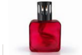
2LSG SQUARE GLASS CATALYTIC DIFFUSER

PACK 3 NET PRICE $ 16.00 PRICE FOR PACK $ 48.00