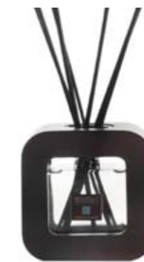
33FR - 250 ml FRAME DIFFUSER SELECTED

PACK 3 NET PRICE $ 14.00 PRICE FOR PACK $ 42.00