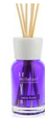
7MD - 100 ml FRAGRANCE DIFFUSER

PACK 3 NET PRICE $ 17.50 PRICE FOR PACK $ 52.50