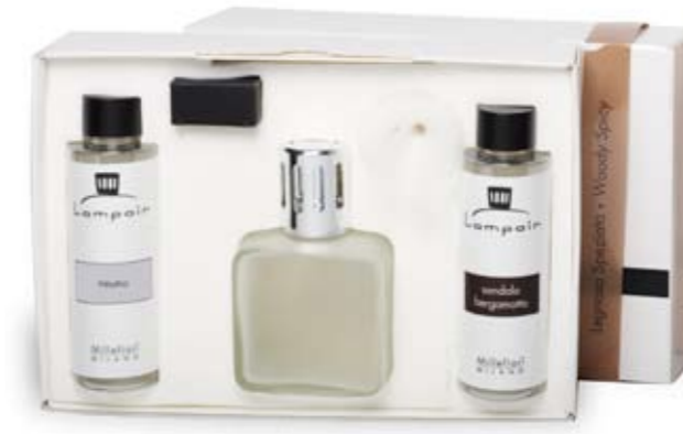
2DL DISCOVER LAMPAIR

PACK 3 NET PRICE $ 20.00 PRICE FOR PACK $ 60.00