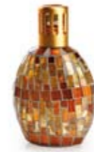
1LMOBZGO bronze gold

PACK 3 NET PRICE $ 27.50 PRICE FOR PACK $ 82.50