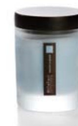
33SG - 200 gr SCENTED CANDLE IN JAR

PACK 3 NET PRICE $ 6.00 PRICE FOR PACK $ 18.00