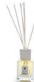
4MD - 100 ml FRAGRANCE DIFFUSER

PACK 3 NET PRICE $ 26.00 PRICE FOR PACK $ 78.00