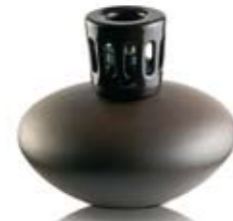
1LAC - large CERAMIC CATALYTIC DIFFUSER

PACK 3 NET PRICE $ 17.00 PRICE FOR PACK $ 51.00