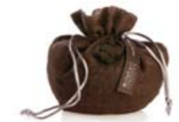
33SAT - 1 piece FABRIC SACHET

PACK 3 NET PRICE $ 12.00 PRICE FOR PACK $ 36.00