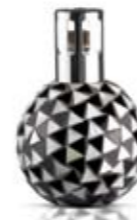
1LMOBKWH black white

PACK 3 NET PRICE $ 13.00 PRICE FOR PACK $ 39.00