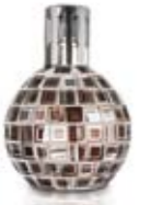
2LMOBZWH bronze white