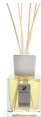
4DD - 250 ml FRAGRANCE DIFFUSER

PACK 3 NET PRICE $ 26.00 PRICE FOR PACK $ 78.00