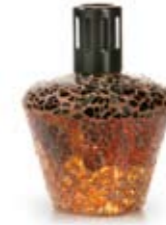
2LMOCKBW cracklé brown