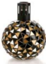
1LMOBKGO black gold