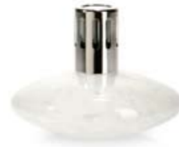
2LALWH - white CATALYTIC DIFFUSER ALADIN

PACK 3 NET PRICE $ 27.50 PRICE FOR PACK $ 82.50