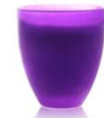
7SG - 200 gr SCENTED CANDLE IN JAR

PACK 3 NET PRICE $ 10.00 PRICE FOR PACK $ 30.00