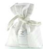
4SAT - SET/2 pieces SCENTED SACHET

PACK 3 NET PRICE $ 15.00 PRICE FOR PACK $ 45.00