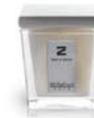
4BP - 160 gr SCENTED CANDLE IN JAR

PACK 3 NET PRICE $ 16.00 PRICE FOR PACK $ 48.00