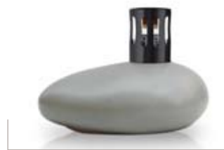
2LSTO STONE CATALYTIC DIFFUSER

PACK 3 NET PRICE $ 20.00 PRICE FOR PACK $ 60.00