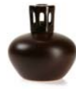
2LACS - small CERAMIC CATALYTIC DIFFUSER

PACK 3 NET PRICE $ 13.00 PRICE FOR PACK $ 39.00