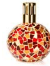
2LMOGORD gold red