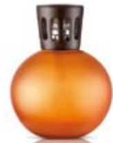
1LAS - large SPHERE CATALYTIC DIFFUSER

PACK 3 NET PRICE $ 24.00 PRICE FOR PACK $ 72.00