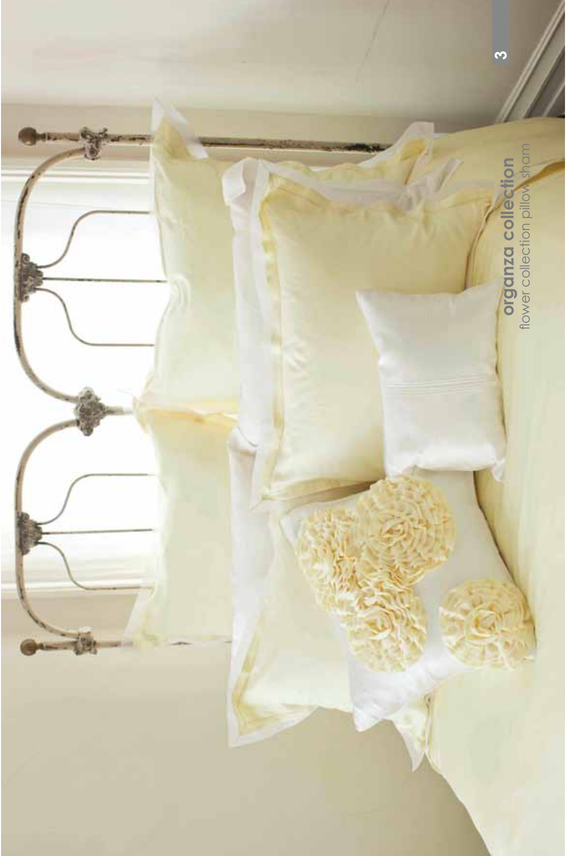
organza collection flower collection pillow sham