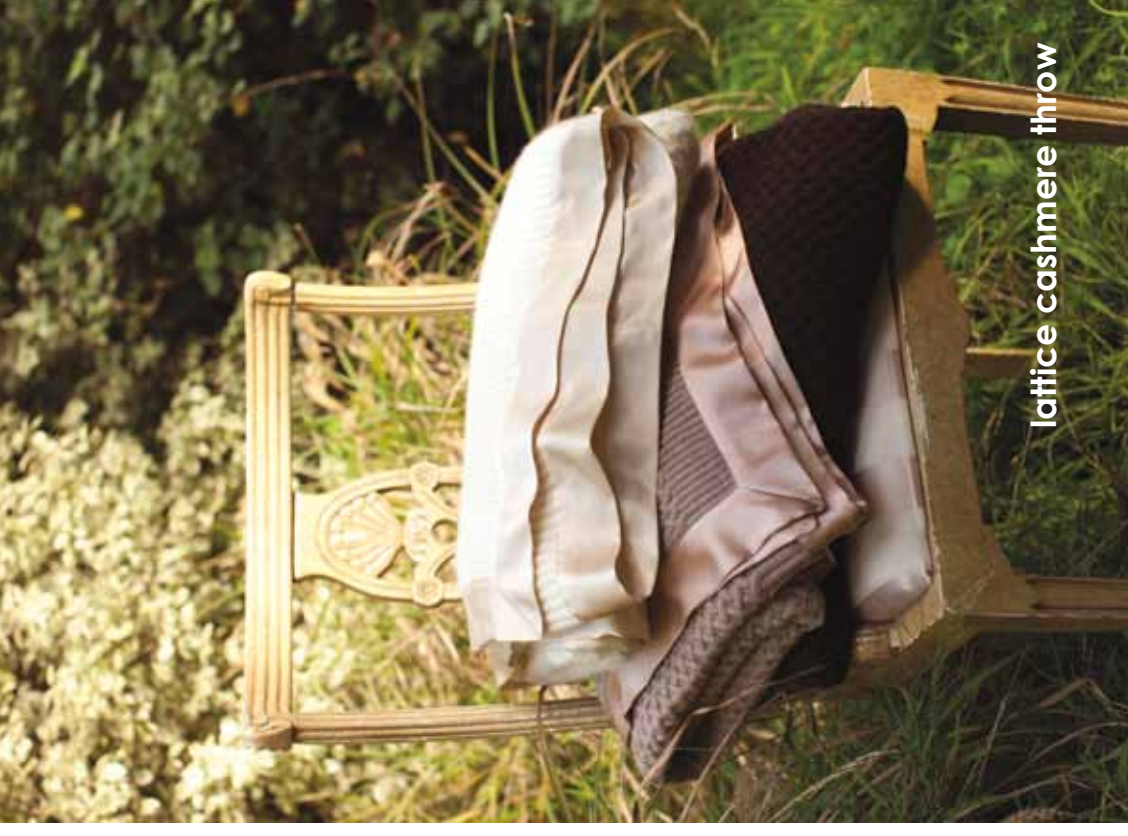
lattice cashmere throw