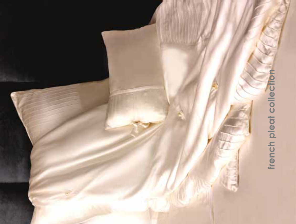
french pleat collection