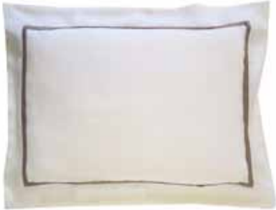
feather with contrasting color

available in the following color combinations: